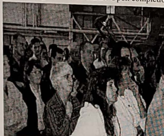
507th members show their concern during the conversion announcement Nov. 12.

The 301st Rescue Squadron and its HC-130N/P and HH-60G aircraft will temporarily realign from Homestead AFB to Patrick AFB, Fla., in a permanent change of station status. Upon completion